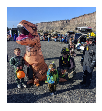
Trunk or Treat