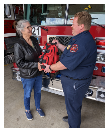
Emergency Preparedness Open House